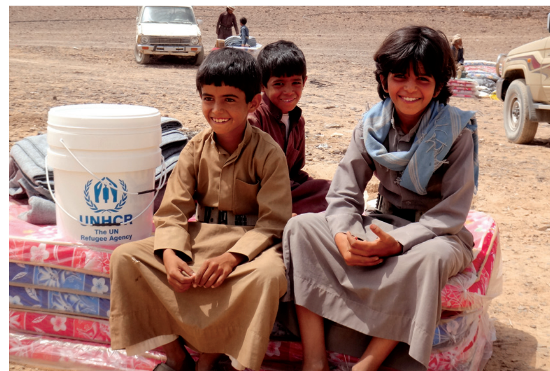
Displaced Yemeni children in Sirwah, Ma'rib governorate.

Supply readiness was strengthened through the pre-positioning of relief items closer to "hot spot" areas, as well as by increasing logistics capacity, to respond to operational needs more rapidly. UNHCR also actively engaged in the "Ready to respond" initiative, working alongside DFID, OCHA, UNICEF and WFP to improve emergency response capacities, advance inter-agency coherence in humanitarian action, and yield efficiencies in the longer term.