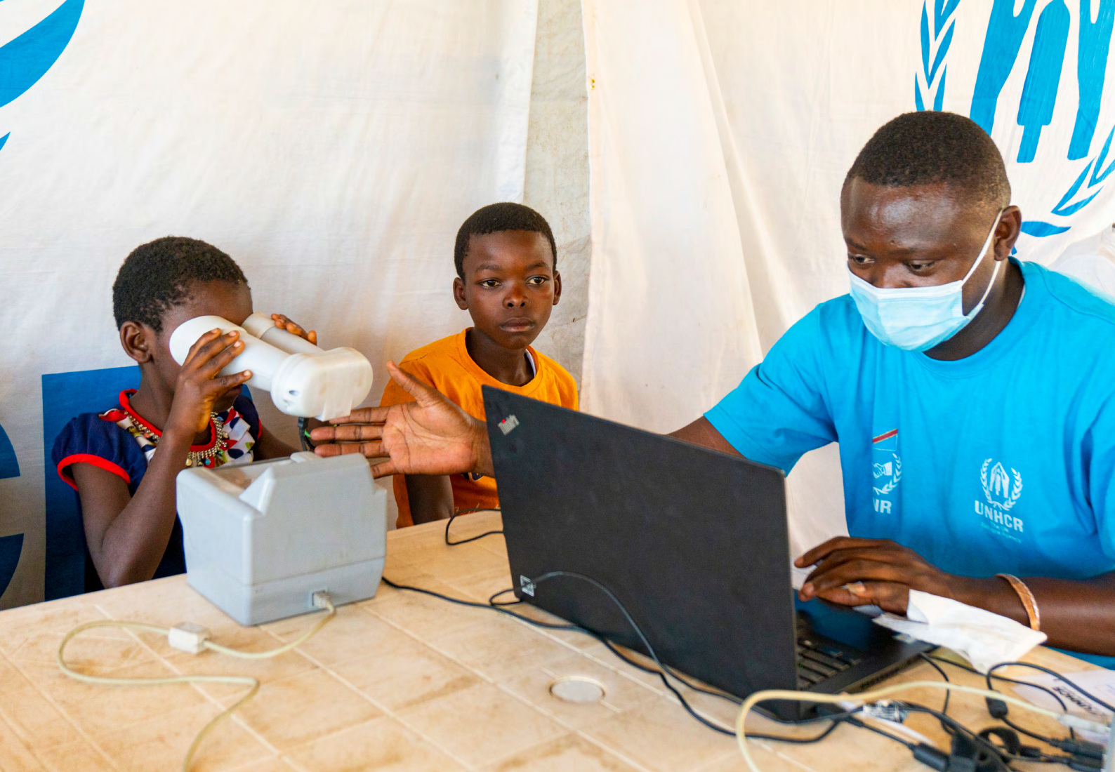
Democratic Republic of Congo. Burundian refugees' children and asylum seekers are biometrically registered