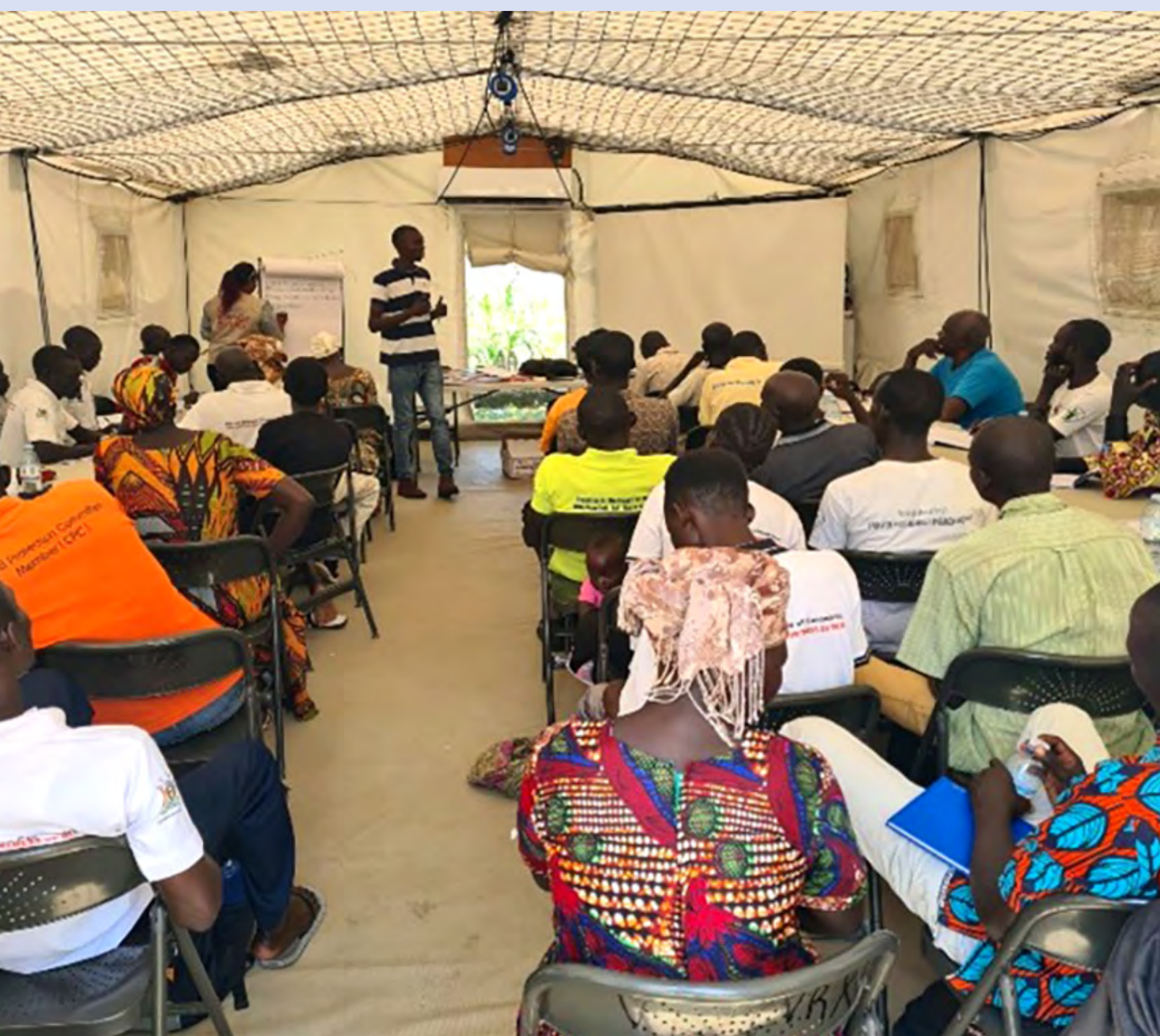
A mentor training participants in conflict management in Imvepi Settlement

There is inadequate funding and opportunities for youth. Prioritization exercises for humanitarian programming often result in youth programmes being underfunded, hence it is vital to work within nexus programming to ensure that all of the needs of youth are met.