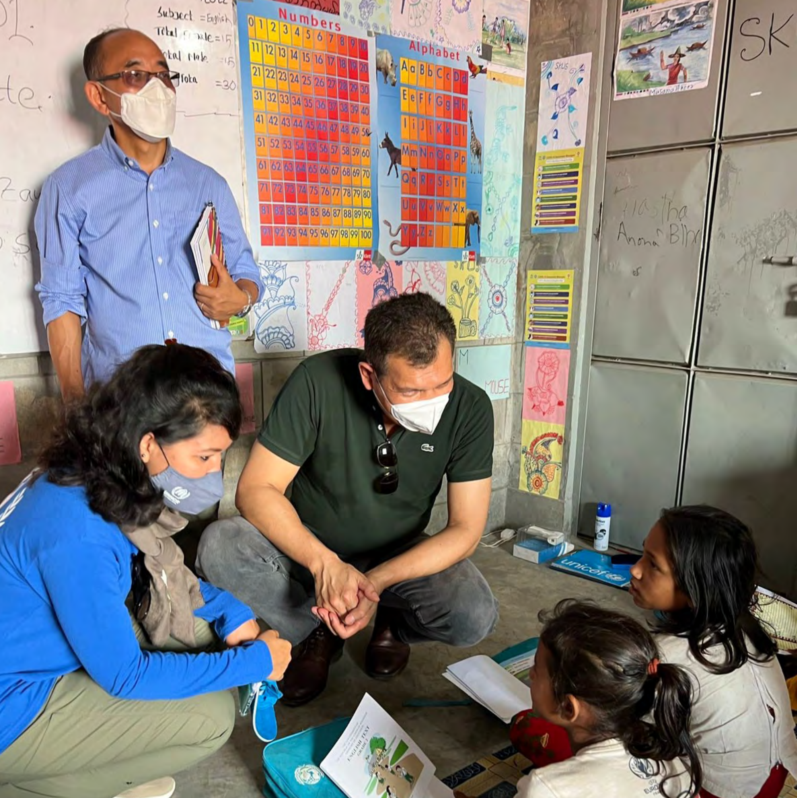
ADB Country Director Edimon Ginting meeting Rohingya refugee students at a learning centre ©UNHCR/Nodoka Hasegawa.

The first phase of the ADB Emergency Assistance Project did not apply an overall Resettlement Framework (as part of the social safeguards policy) for in-camp access road construction, although some shelters along the road were impacted by the constructions. In light of this, UNHCR facilitated consultations with refugees, which eventually informed the road construction and allowed for a budget to be established for new shelters and for the relocation of affected refugees before construction started. Following the implementation of DRF+, it is recommended that the ADB safeguard policy be adapted to cater for such situations.